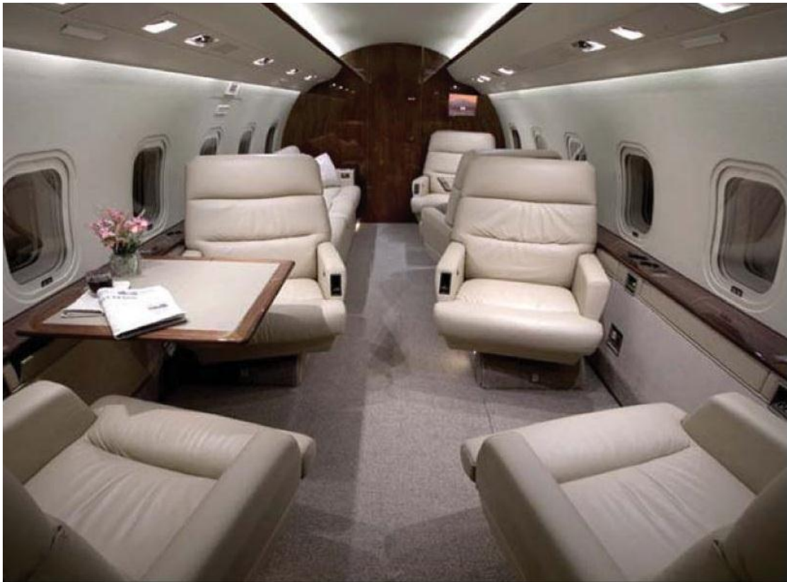
Interior aft view

This Challenger 604 offers a ten passenger executive interior configured with a four-place club grouping with fold-out tables in the forward cabin, a four-place divan opposite a two-place opposite a two-place club group with fold-out table. A forward “S” shaped galley is equipped with a microwave oven, high temp oven, coffee maker and wine storage along with an extended aft lavatory completes the VIP executive interior. The passenger entertainment features: